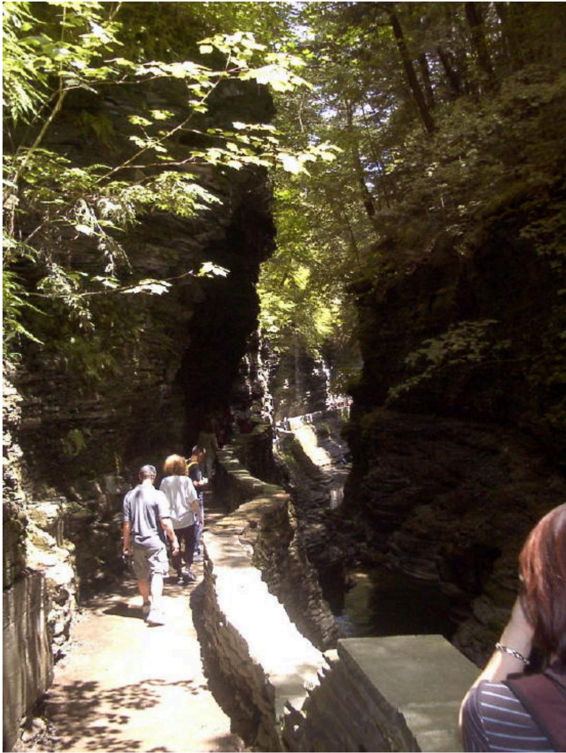
Waktins Glen. More than a race-track! The natural beauty of this place is so pretty and relaxing. We rode to the top, walked down in less than an hour and took a bus back up.