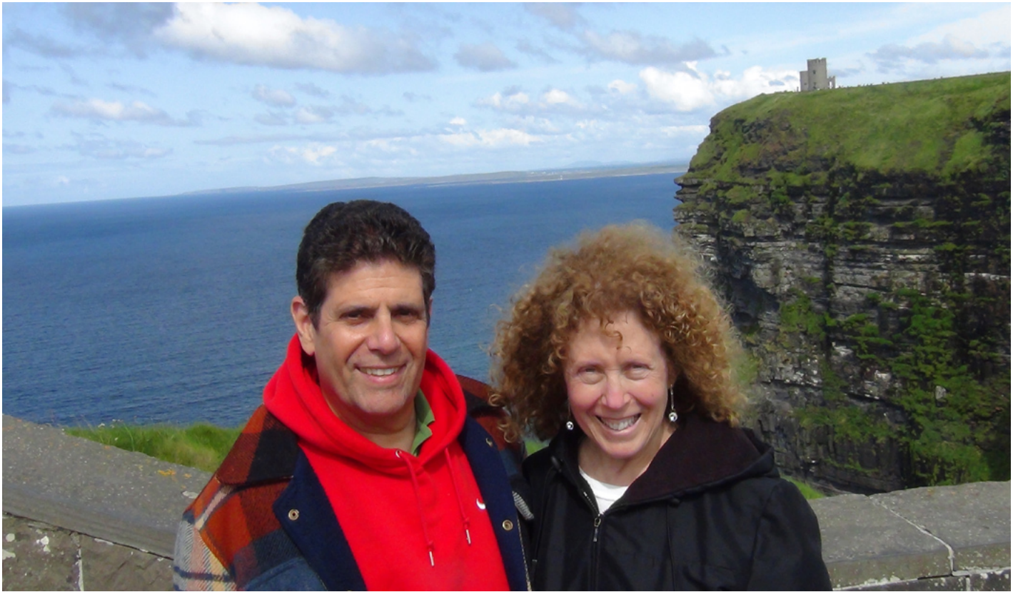
Here we are at the western end of Ireland, at the fabulous Cliffs of Moher!