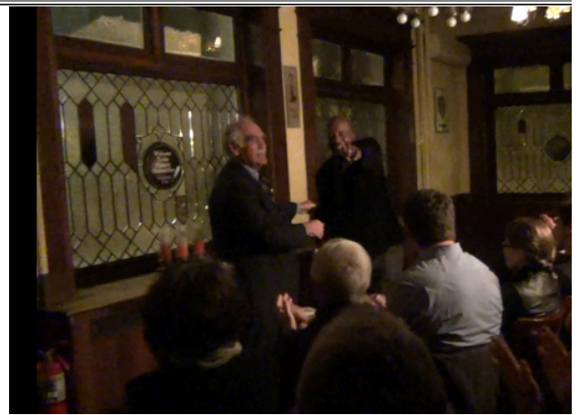
The crowd appreciated them!