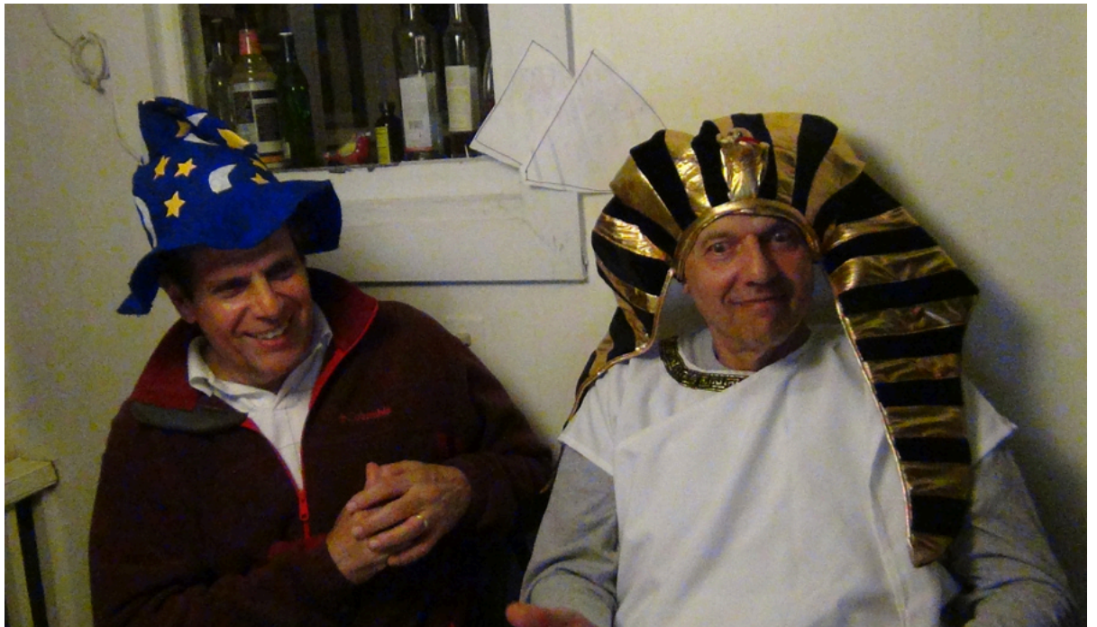
King Tut was interviewed in August by Merlin. Weren't they contemporaries?