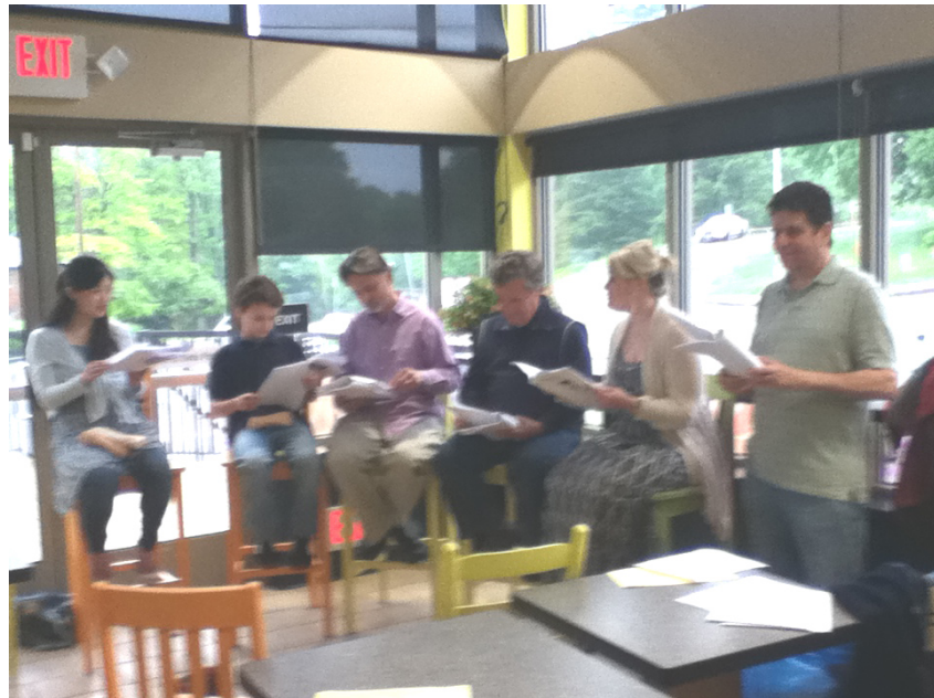
A reading of Life in a Washing Machine at our local Creekside Coop in Elkins Park