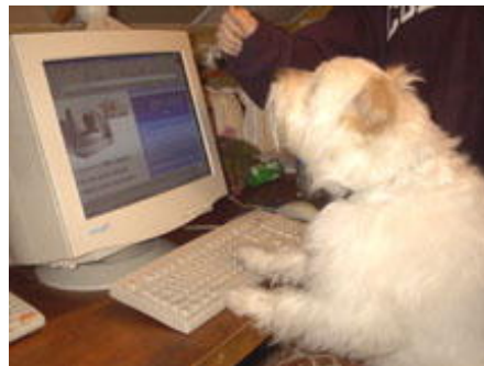
Here she was, ordering Omaha Steaks while we slept!

Our dear and noisy canine partner for 26 years, Bailey, has died. She was a fine barker, good running companion, sitter. She genuinely seemed to listen to our blatherings. We miss her tremendously.