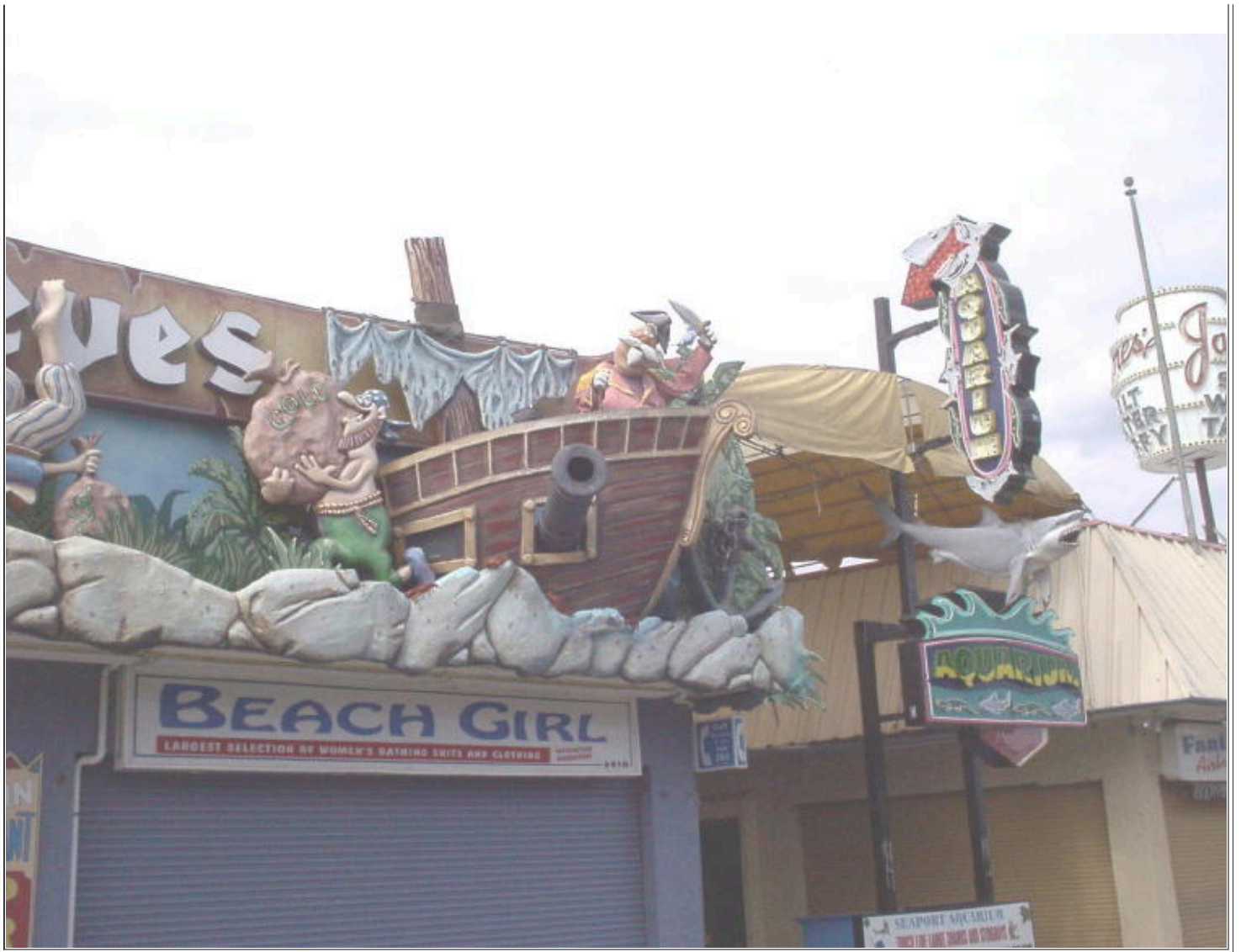
Garish amusement park creatures for you and... That's all for now!