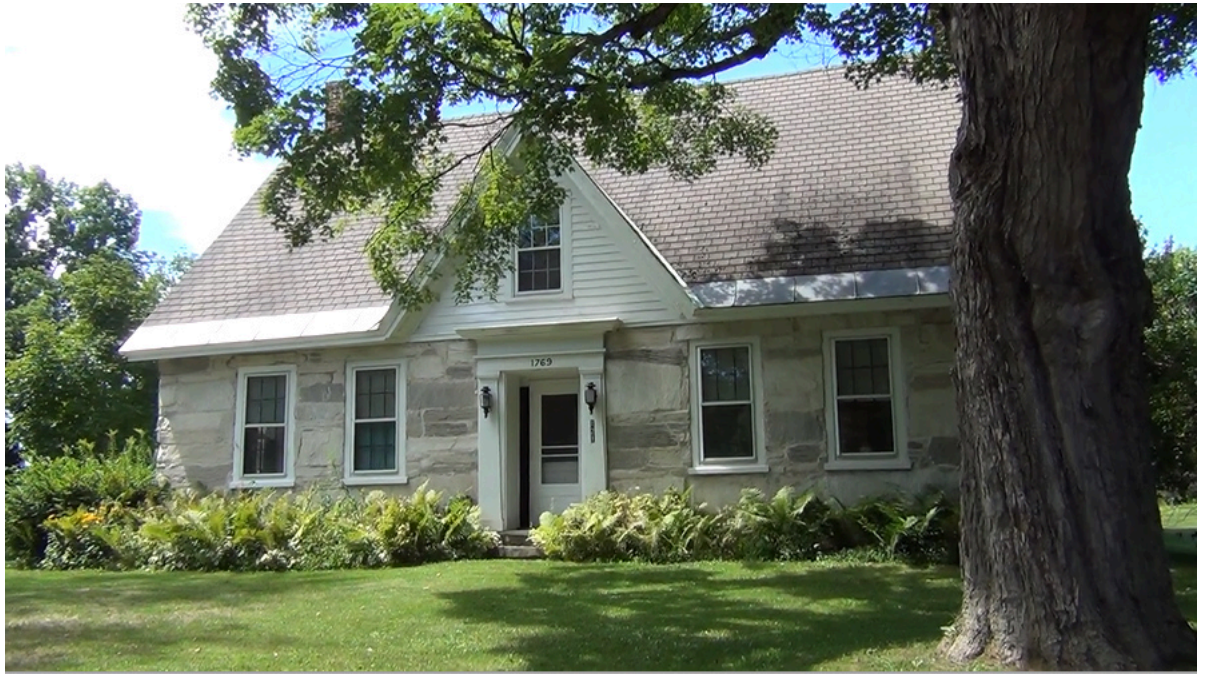
Robert Frost's home in Shaftsbury, VT