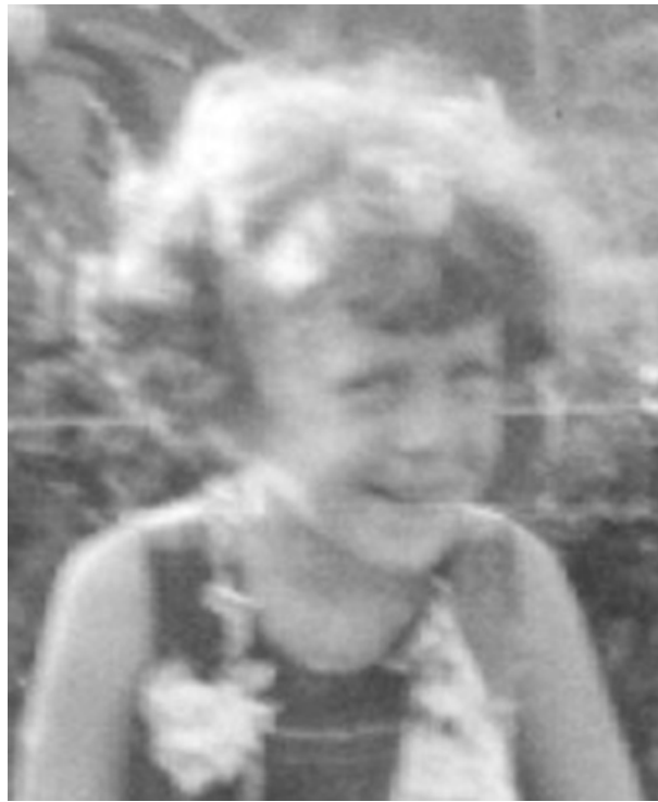
Do you recognize this girl, circa 1955?