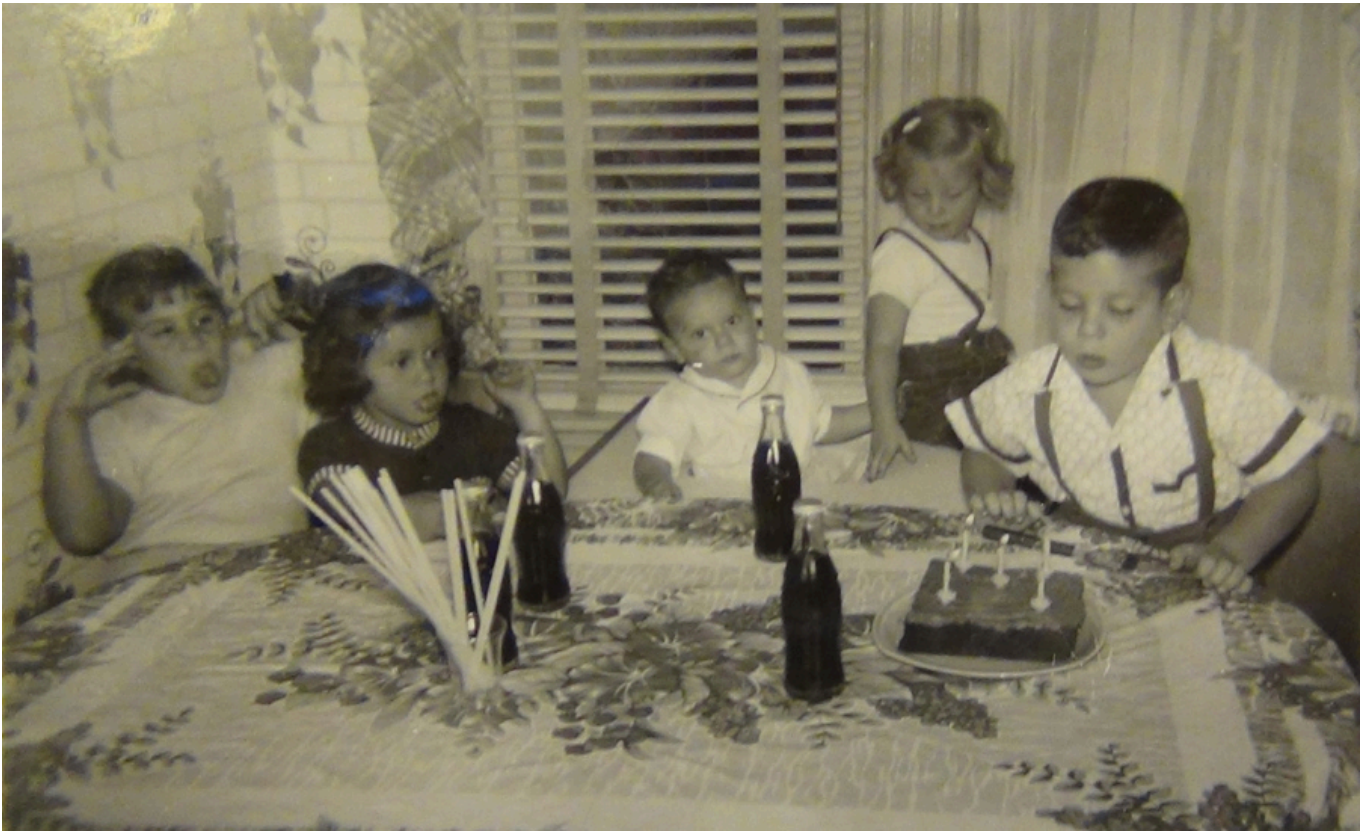
My fifth Birthday Party, at our Brooklyn apartment at 732 Alabama Avenue.