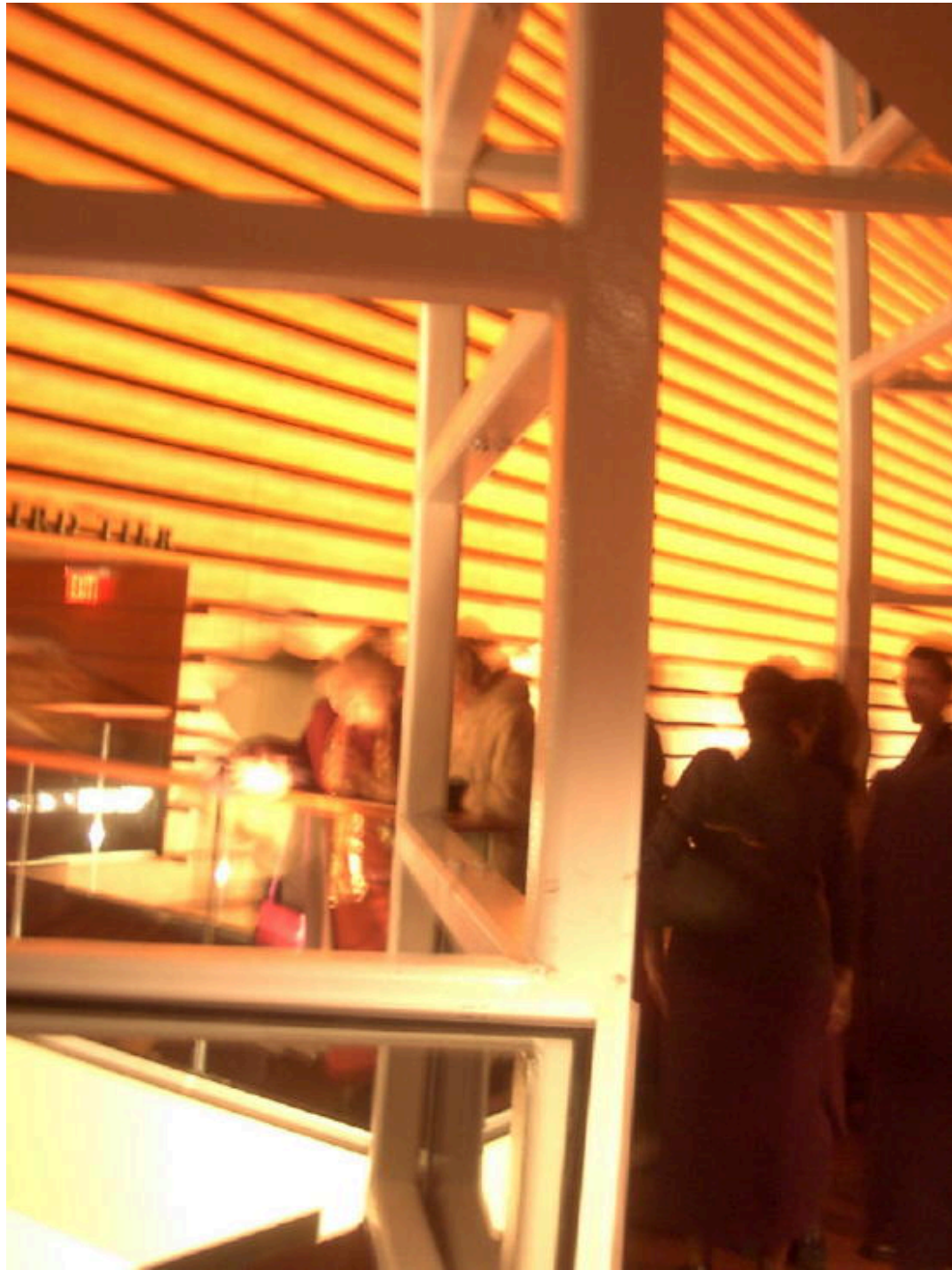
Even walkways to enter Verizon Hall have their special drama.