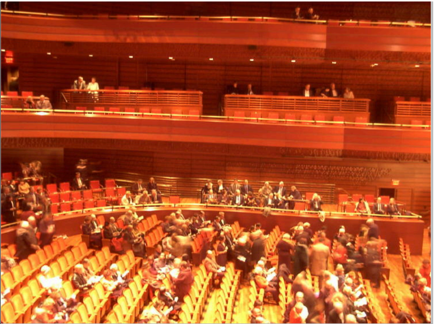
The interior of Verizon Hall resembles a cello.