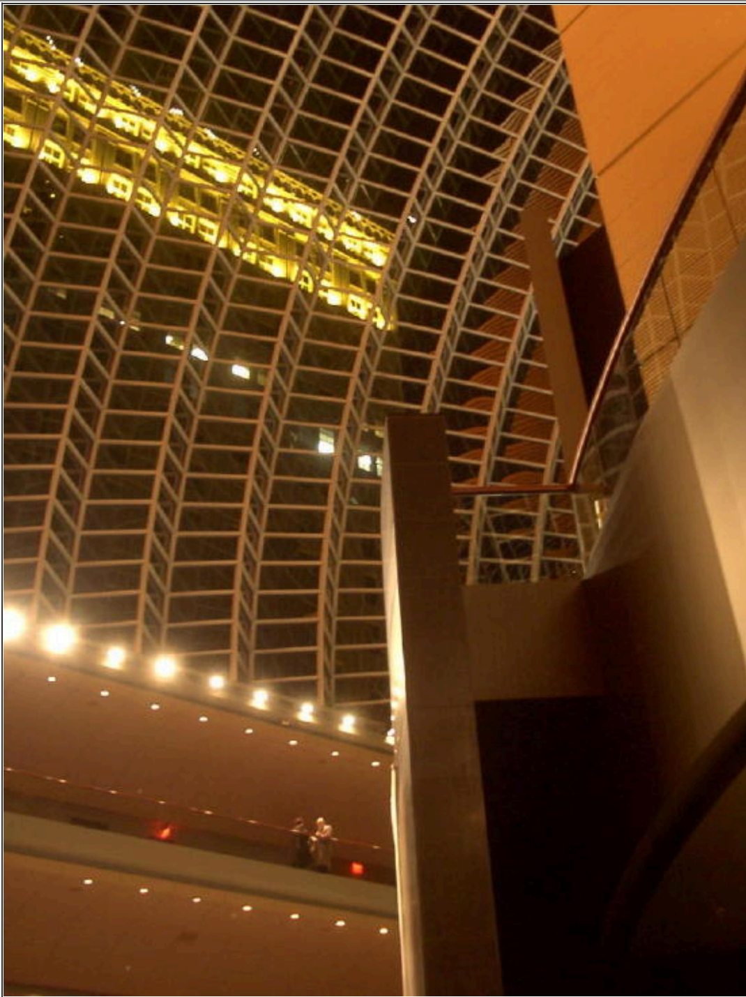
This view shows the adjacent building's rooftop frieze, just north of the Center, across the street, but still on South Broad.