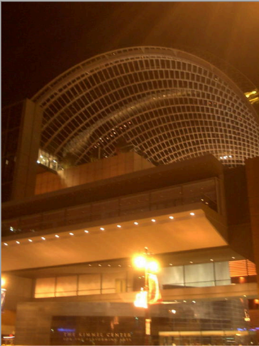
This exterior view from South Broad Street shows the huge roof. Below it is a rooftop garden.