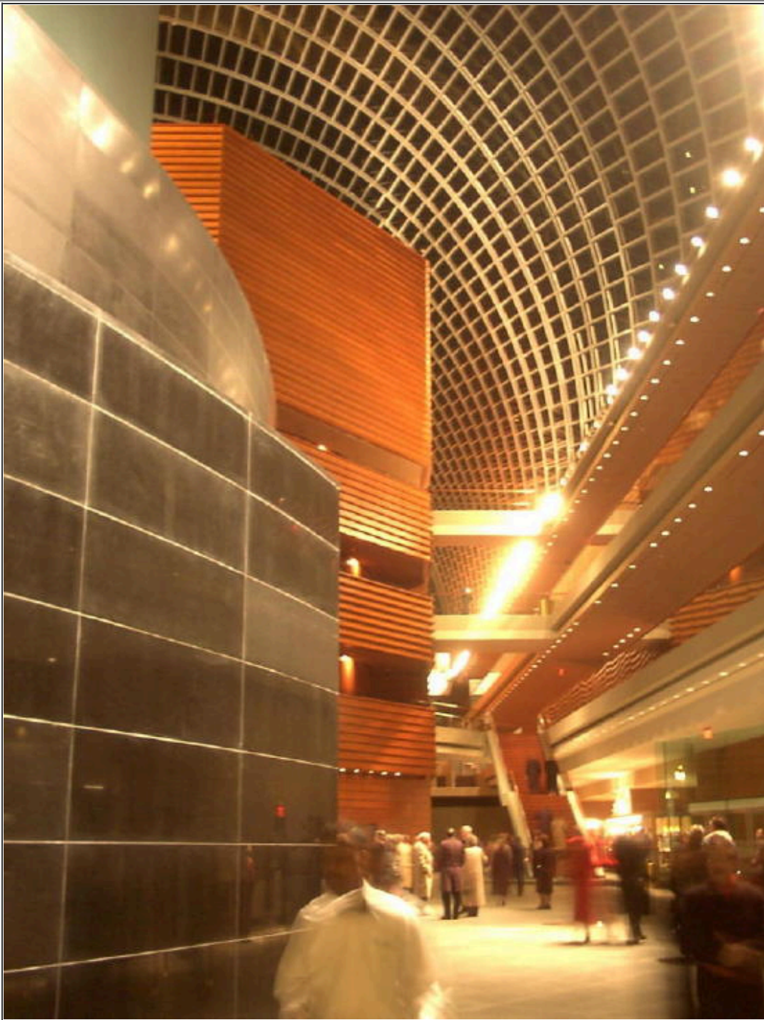
The dramatic lobby of the Kimmel Center, showing the Perelman Theater in the foreground (black), and Verizon Hall (auburn wood).